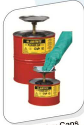
Dispensing Cans For Hazardous Liquids