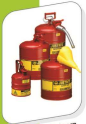
Safety Containers For Flammables

EM Cabinets : DIN EN 14470-1 30,60,90 minutes Fire Cabinets for Flammable Liquids