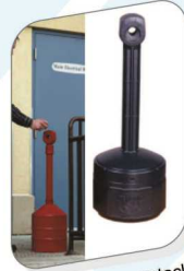
Smoking Receptacles FOR CIGARETTES