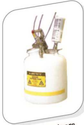
Safety Containers For Laboratories