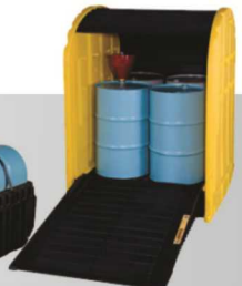
Drum Sheds Outdoor spill protection