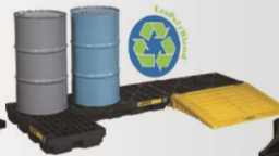
Spill Control Pallets