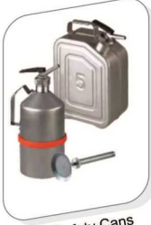
S.S. Safety Cans for Laboratories