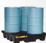
Spill Control Pallets